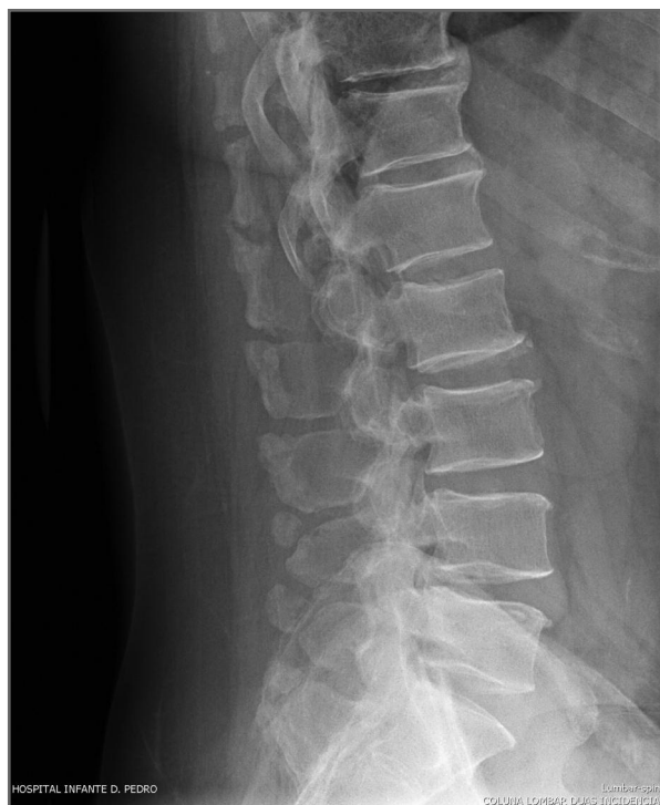
FIGURE 1. Lumbar spine radiography (lateral view)

In conclusion, Baastrup's disease should be considered in differential diagnosis of back pain, although one