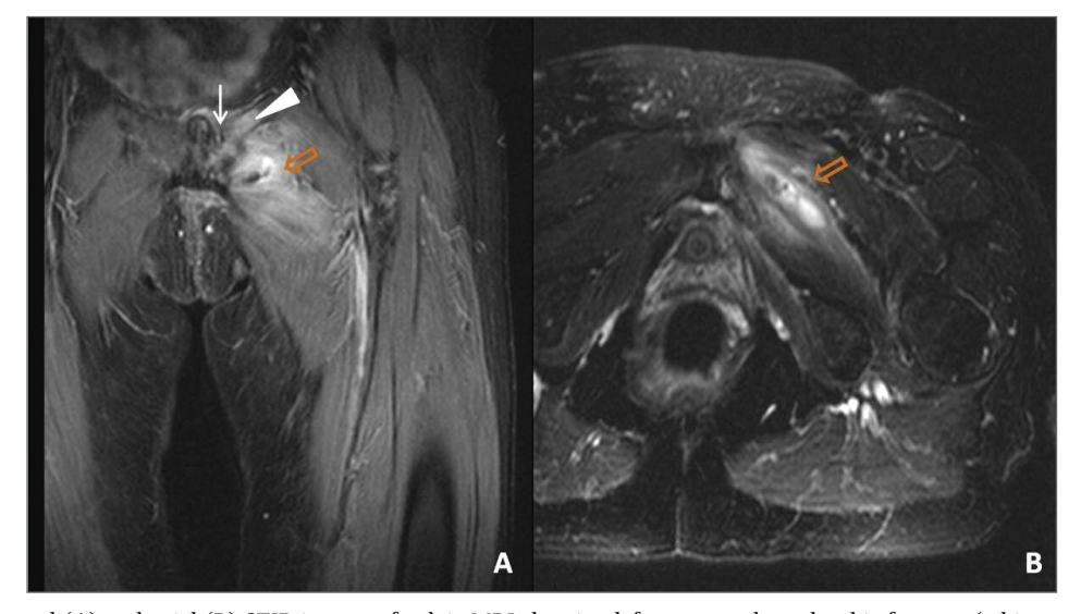
FIGURE 1. Coronal ( A ) and axial ( B ) STIR images of pelvic MRI showing left parasymphyseal pubic fracture (white arrow) with associated bone oedema (arrow head) and adjacent partial muscular avulsion (orange arrow), namely of the external obturador muscle (avulsion-fracture)

A 70-year-old, caucasian woman, presented with a prior history of Parkinson's disease, seronegative rheumatoid arthritis (no reference of corticotherapy), and severe osteoporosis (treated with oral bisphosphonates with irregular compliance) with fractures of bilateral distal radius in April 2011, and left parasymphyseal pubic avulsion-fracture in March 2014 (Figure 1), both of low-impact. Six months later, she refers insidious onset of low back and right buttock pain, 8 in 10 in intensity, with two weeks duration, and progressive deterioration (becoming disabling in the last week to independent gait), irradiating to the ipsilateral knee without paresthesia, not exacerbating with Valsalva maneuvers and decreasing with rest. She denied recent trauma and personal or family neoplasic history.