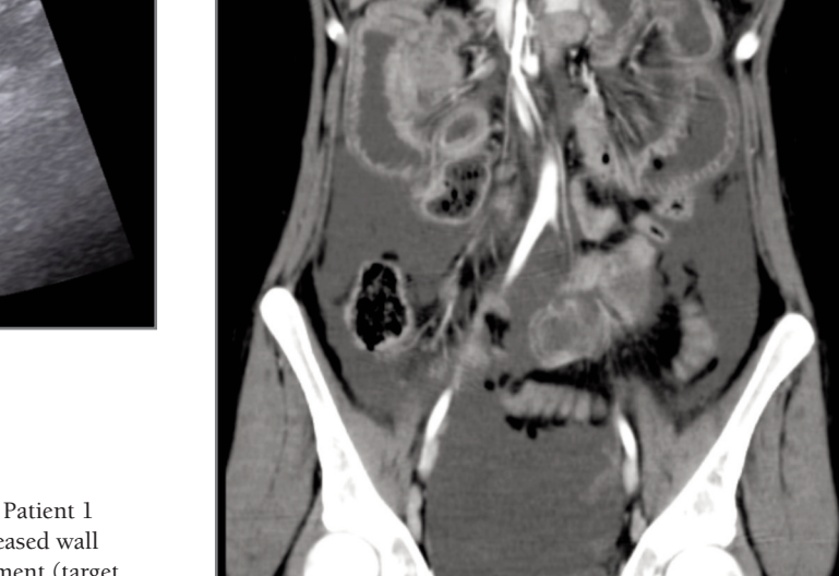
FIGURE 1. Abdominal US (A) and CT (B) from Patient 1 showing similar findings: moderate ascites, increased wall thickening of the colon with abnormal enhancement (target sign) and increased reflectivity of subjacent fat tissue.

of severe hemolytic anemia. She developed acute abdominal pain, nausea, vomiting, increased abdominal volume and anorexia. At hospital admission, the patient was pale and her abdomen tender and painful. Laboratory tests showed anemia, lymphopenia, increased CRP and decreased haptoglobin levels. US revealed ascites, increased echogenicity of renal parenchyma, slight right side hydronephrosis, and thickening of the bladder wall, pyloric region and several segments of the bowel wall. She was then submitted to an abdominal CT scan that revealed moderate to severe ascites. submucosal edema of the antral and pyloric regions, ileum and colon and severe, irregular, bladder wall thickening with reduced distensibility resulting in bilateral hydronephrosis. The treatment strategy was similar to the previous cases. Although the GI symptoms resolved after 48 hours, she kept showing signs of hemolytic anemia and was started on IVIg (400 mg/kg/day for 5 days), with benefit. Three and half months later, she suffered a relapse of the LE and repeated IV MPDN 1g pulses followed by rituximab 1g which had to be switched to MMF 2.5g/day after an infusion reaction. At 2-year follow-up the patient is asymptomatic and with no sign of relapse.