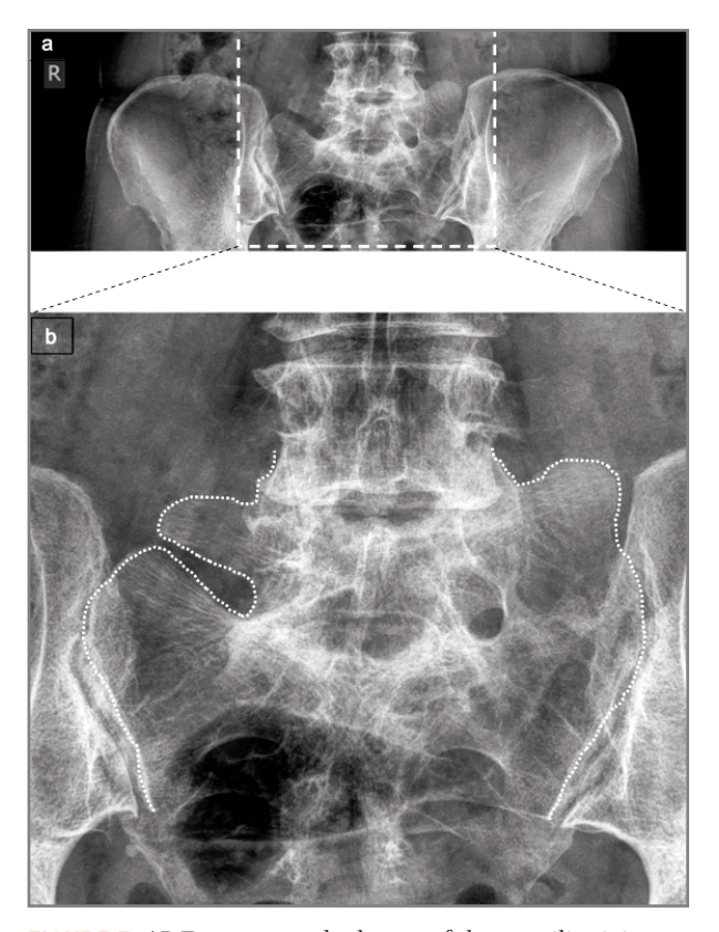
FIGURE 3. AP Ferguson method x-ray of the sacroiliac joints. Note the sacralisation of the L5 vertebral body and the left transverse process. Compare it with the right side (Fig. 3a). Figure 3b in more detail.

tiple projection reconstruction (MPR) revealed sacralization of the L5 especially of the left transverse process which was bridged with the sacrum (Figure 2). Thus, the diagnosis was stenosis and partial left sacralization of the L5 vertebrae, a condition known as Bertolotti syndrome. INF was discontinued and she had 6 courses of physiotherapy and received analgesics with significant improvement.