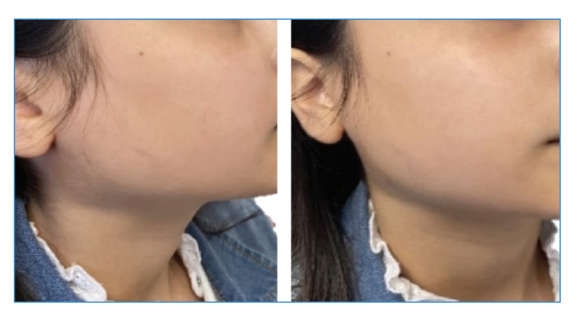
Figure 2. Right Parotid Gland Inflammation

At this point, a diagnosis of chronic bilateral sialadenitis involving the parotid and submandibular glands was established. No evidence of an obstructive, traumatic, lymphoproliferative/neoplastic, or infectious cause had been found so far. Suspicion of an autoimmune/autoinflammatory etiology led to a rheumatology consult.