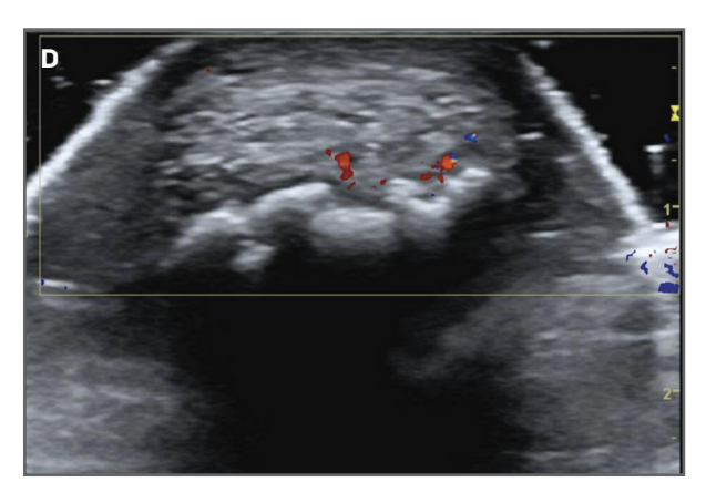
FIGURE 1. Ultrasonographic images of Achilles enthesopathy: ( A ) Longitudinal view: thickening, loss of fibrillar pattern, bone proliferation and erosions. ( B ) Transversal view: loss of fibrillar pattern and erosions. ( C ) Longitudinal view: thickening, loss of fibrillar pattern, bursa, erosions and Doppler signal. ( D ) Transversal view: loss of fibrillar pattern, erosions and Doppler signal