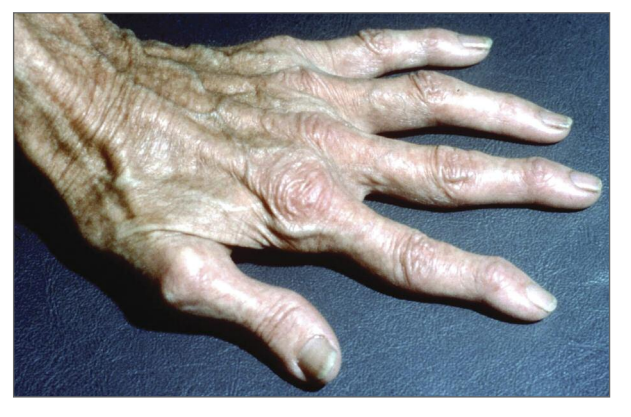
FIGURE 2. Acrogeria in a 32-year-old woman with EDS vascular type. The hand looks much older than the patient really is.

EDS vascular type is associated with a bad prognosis: patients often die relatively young from rupture of arteries and/or hollow organs, such as intestines and uterus during pregnancy<sup>73</sup>. The typical phenotype consists of thin and translucent skin, showing underling veins, giving especially the hands an aged appearance ('acrogeria', see Figure 2) and nonspecific dimorphic features of the face. However, all these typi-