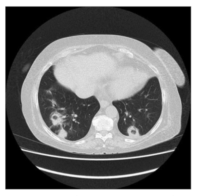
FIGURE 1. CT scan, performed during hospitalization before corticosteroid therapy, showing multiple reversed halo signs involving predominantly the lower lobes

areas of consolidation. CT scan disclosed multiple and bilateral ground glass opacities surrounded by rings of consolidation (reversed halo sign), distributed mainly in the lower zones of the lungs (Figure 1). Bronchoalveolar lavage (BAL) fluid showed an increase in lymphocyte count (30%), a decrease in the CD4/CD8 ratio (0.5) and a low number of eosinophils (less than 5%). BAL cultures and serology were negative for bacteria, fungi, mycobacteria and viruses. The patient refused transbronchial biopsy. An open lung biopsy of the right lower lobe was performed, and pathological findings were consistent with organizing pneumonia (OP) (Figure 2). Therefore, the patient was diagnosed with organizing pneumonia associated with rheumatoid arthritis. Therapy with intravenous methylprednisolone (40mg/day) was begun and visible clinical improvements were seen within one week. The patient was