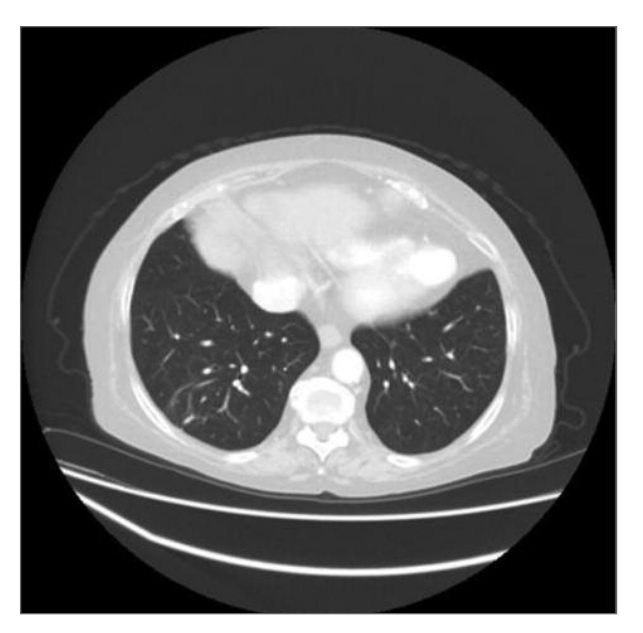
FIGURE 3. CT scan, performed three months after methylprednisolone treatment, showing an almost complete resolution of pulmonary opacities

To our knowledge, in literature are reported several cases of both OP secondary to connective tissue diseases and OP presenting with reversed halo sign. On the other hand, this is the first case of bronchiolitis obliterans organizing pneumonia secondary to rheumatoid arthritis presenting with reversed halo sign.