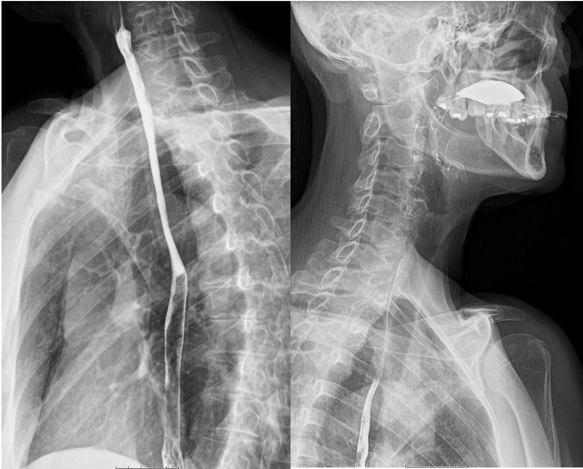
Figure 2. Barium oesophageal transit study showing proximal stenosis.