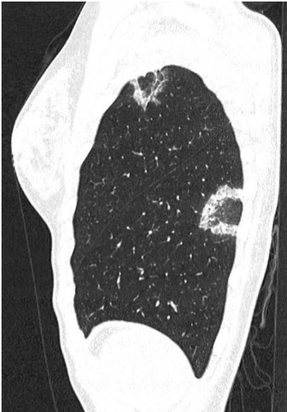
Figure 4: CT-scan (sagittal plane) showing two subpleural consolidation with a reversed halo sign image: 1 in the left superior lobe (31x20 mm) and 1 in the left lower lobe (45x26 mm)