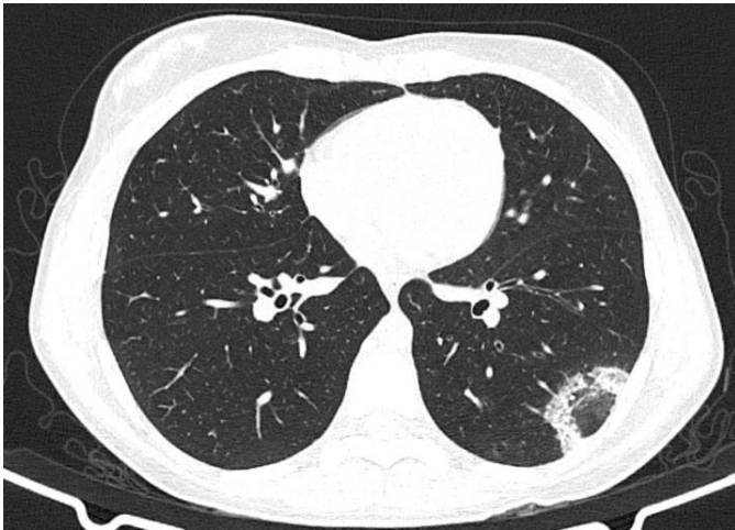
Figure 2: CT-scan (axial plane) showing a subpleural consolidation with a reversed halo sign image (ground glass center with a surrounding consolidation) in the left lower lobe