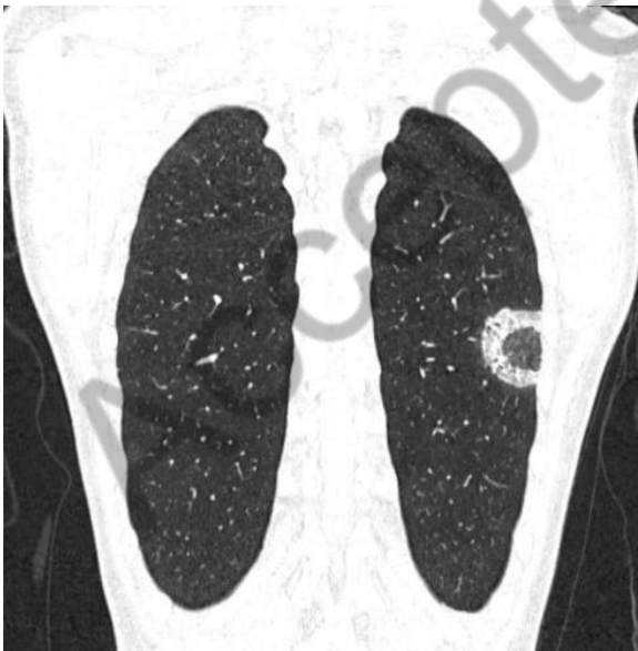
Figure 3: CT-scan (coronal plane) showing a subpleural consolidation with a reversed halo sign image (ground glass center with a surrounding consolidation) in the left lower lobe