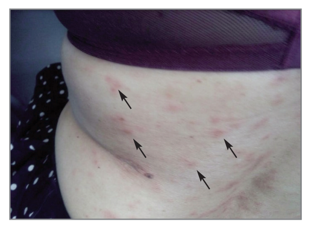
FIGURE 2. Macular, erythematosus, cutaneous lesions on the trunk.