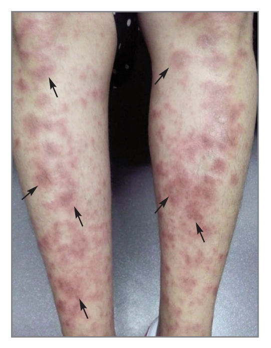
FIGURE 3. Macular, erythematous, annular cutaneous lesions, some coalescing to form polycyclic plaques on the lower legs.

1 month and completely withdrawn at the 5^{th} month of treatment, without recurrence of symptoms, even after more than two years of follow up.