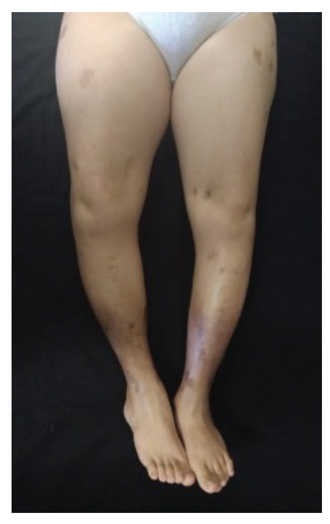
Figure 1. Bow deformity of inferior limbs

line in the diaphysis of the right femur with irregular sclerotic edges, consistent with a pseudofracture (Figure 2). Signs of previous lengthening procedures and arthrodesis of the left ankle were also observed (Figu-res 2-4). Laboratory analysis (Table I) revealed low serum calcium with elevated parathormone (PTH), hypophosphatemia, low 25-OH-vitamin D, and slightly elevated serum alkaline phosphatase. Measurement of 1,25-(OH)2-vitamin D was not accessible in our laboratory. Ultrasonography excluded nephrocalcinosis and nephrolithiasis. Dual-energy X-ray absorptiometry (DXA) revealed a T-score of -2.7 and of -3.2 in the lumbar spine and total hip respectively.