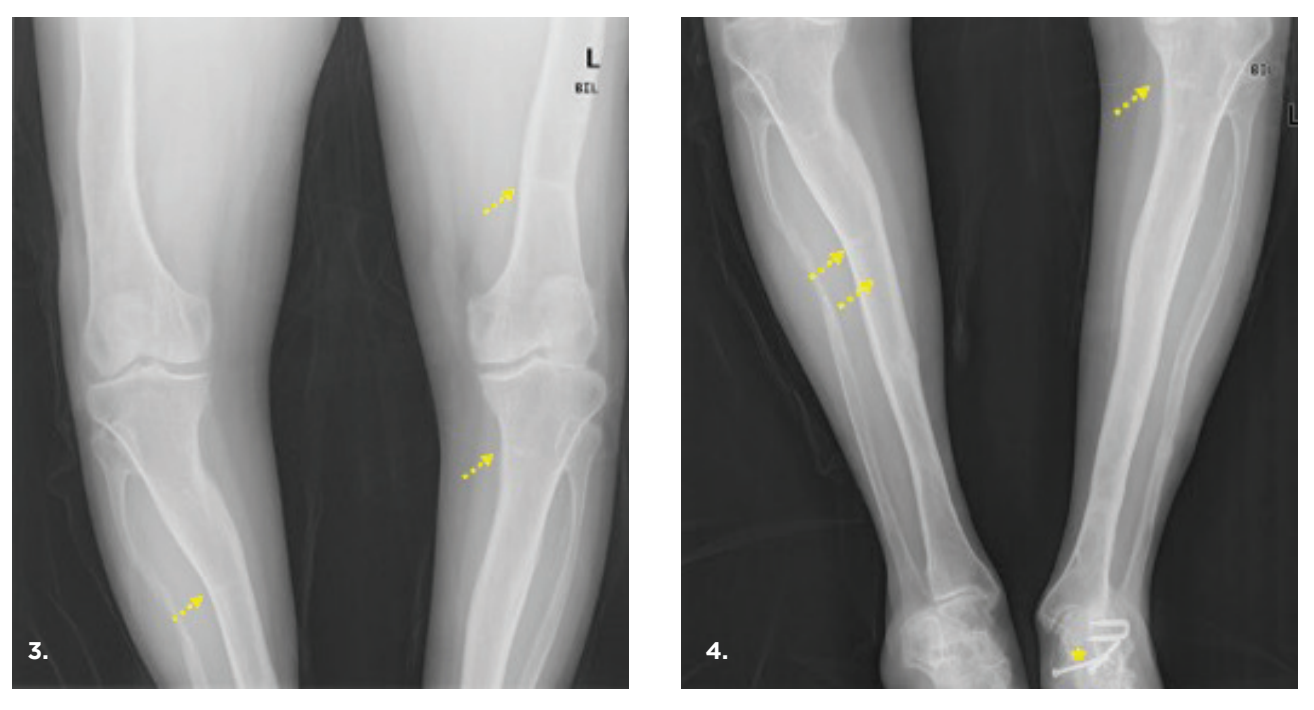
Figures 3 and 4. Radiography of long bones revealing enlarged epiphyses and signs of previous lengthening procedures (dotted arrows). Figure 4 reveals signs of previous ankle arthrodesis (*).