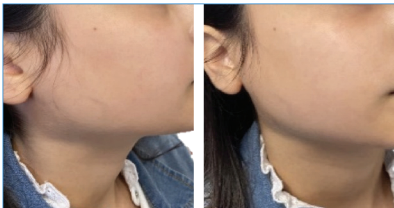
Figure 2. Right Parotid Gland Inflammation

At this point, a diagnosis of chronic bilateral sialadenitis involving the parotid and submandibular glands was established. No evidence of an obstructive, traumatic, lymphoproliferative/neoplastic, or infectious cause had been found so far. Suspicion of an autoimmune/autoinflammatory etiology led to a rheumatology consult.