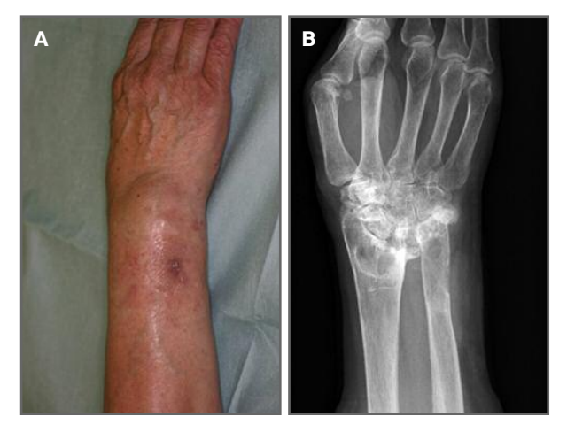
FIGURE 1. Preoperative appearance and plain radiograph of the right wrist. A) Swelling of the dorsal and ulnar sides; a fistula was found on the ulnar side of the right wrist. B) Plain radiograph of the right wrist showed narrowing of the radiocarpal joint, cystic change in distal radius and ulna, discontinuity of the ulnar cortex of distal ulna, and widening of the distal radioulnar joint. The irregularity of ulnar cortex of distal ulna was near to the fistula

performed further examinations under suspicion of an infection. The patient's blood examination revealed a white blood cell count of 6230 cells/mm3, erythrocy-te sedimentation rate of 21 mm/hr, CD4-positive