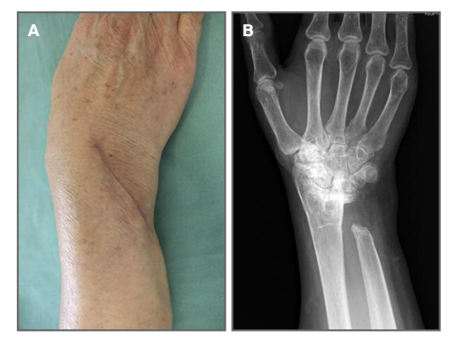
FIGURE 4. Final follow-up appearance and plain radiograph of the right wrist. A ) Swelling of the right wrist had disappeared at the final follow-up. B ) Final follow-up plain radiograph of the right wrist showed the change in distal radius from preoperative cystic lesion to sclerosis. No osteolytic change was observed at the resected ulna

fections in immunocompromised patients have received attention recently, there also have been sporadic reports of these infections in immunocompetent patients. The mechanism of musculoskeletal system infection due to NTM has been reported as occurring via hematogenous contamination from surgical treatment or penetrating injury, and steroid injections<sup>2.6</sup>. In this case, a hematogenous spread or a minor trauma associated with the patient's job may be the cause as there was no history of obvious trauma.